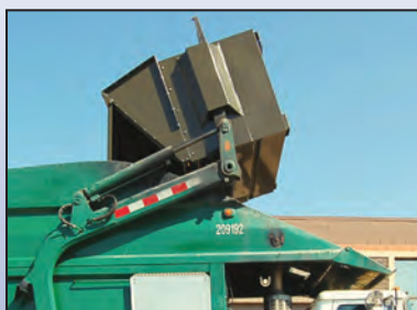
Manual or auto release unloading door.