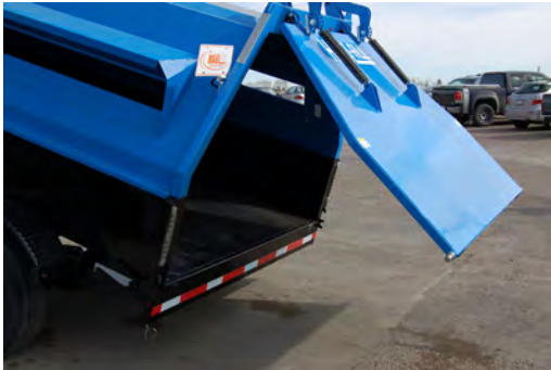
Large spring-loaded tailgate for easy unloading.