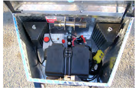
Lockable tool box in A-frame encloses power pack.