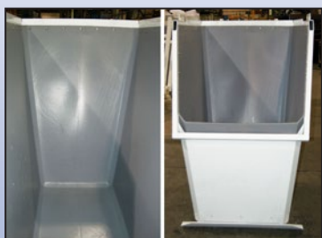
Interior poly liner retains material, moisture, and prevents corrosion.