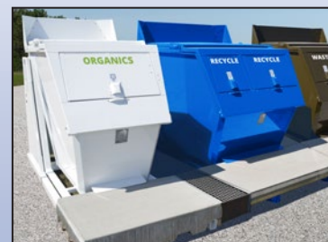
Designed to work with existing container footprint.

Galvanneal steel panels and an Axalta powder paint finish ensures a long life, for lower lifecycle costs & total cost of ownership.