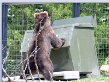
Hyd-A-Way is our original BearTight container, bear tested and certified!