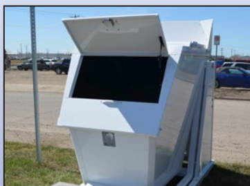
Loading door prop for easier material loading.